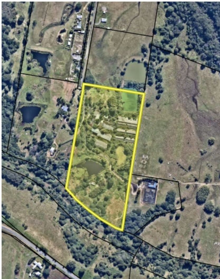
Figure 1: Subject land

This Planning Proposal relates to 103 Yagers Lane, Skinners Shoot legally described as Lot 8 DP 8385, as shown below in Figure 1.