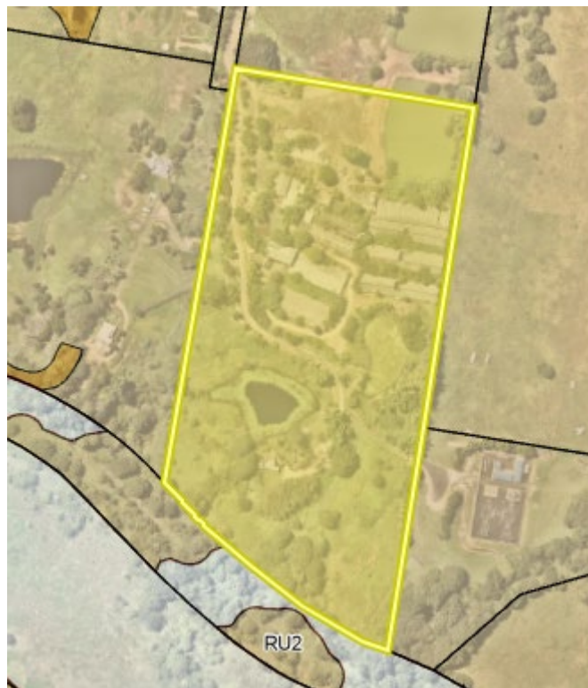
Figure 2: Land zone map under LEP 2014

The land has an area of approximately 9.11 hectares and the street address is 103 Yagers Lane, Skinners Shoot.